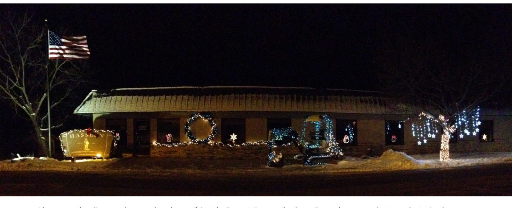
Above: Hasslen Construction was the winner of the Big Stone Lake Area business decorating contest in December! The theme was "Constructing Holiday Cheer." Second place was Barr's Conroy Electric and third place was Grandma's Thrifty Hideaway.